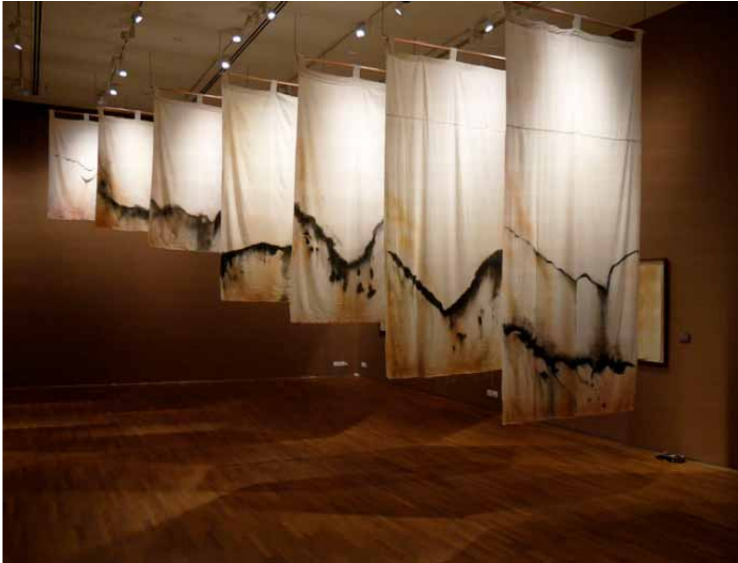
Gully Curtains by Tang Da Wu, 1979 [Fig. 3a]

Ink and mineral pigment on cloth, 393cm x 144cm ; 277 x 134 cm; 236 x 122cm; 217 x 110cm; 170 x 105cm; 138 x 94cm; 135 x 89cm.