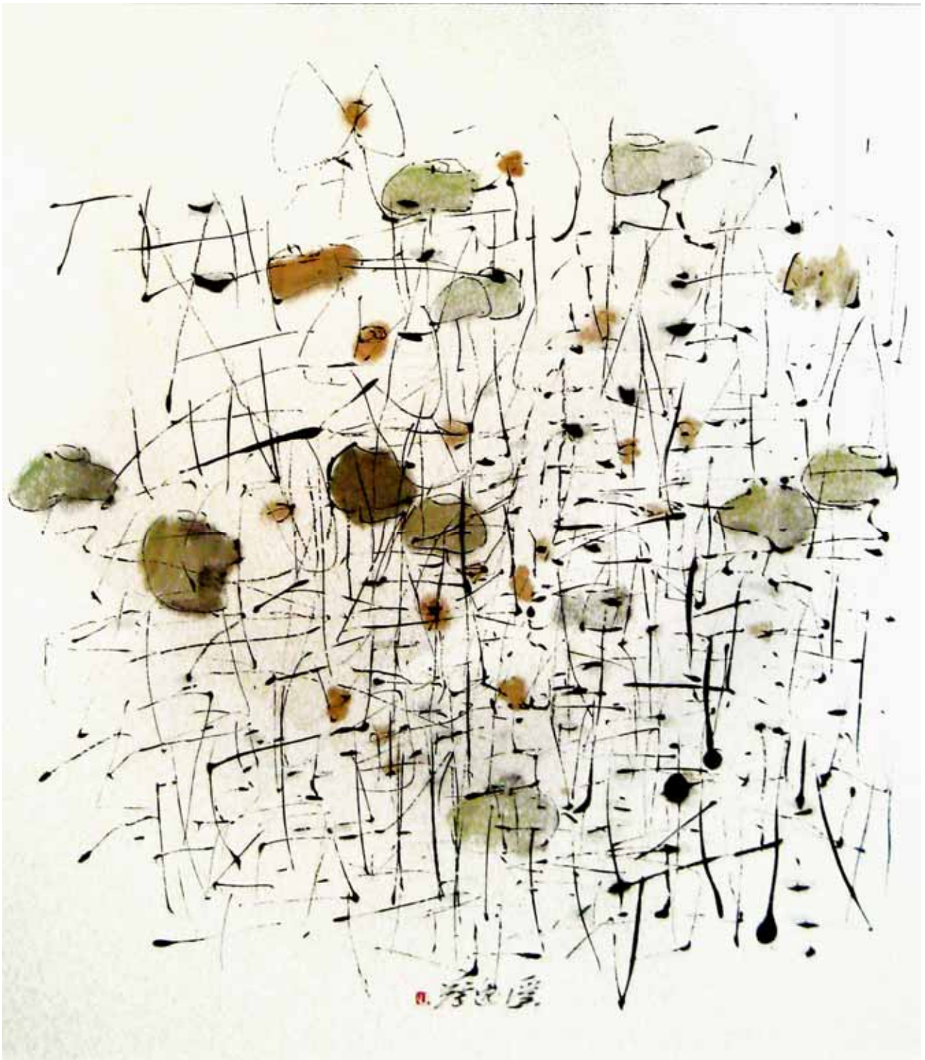
Lotus Pond by Chua Ek Kay, 2005 [Fig. 4b] Ink on rice paper, 74cm x 82cm.