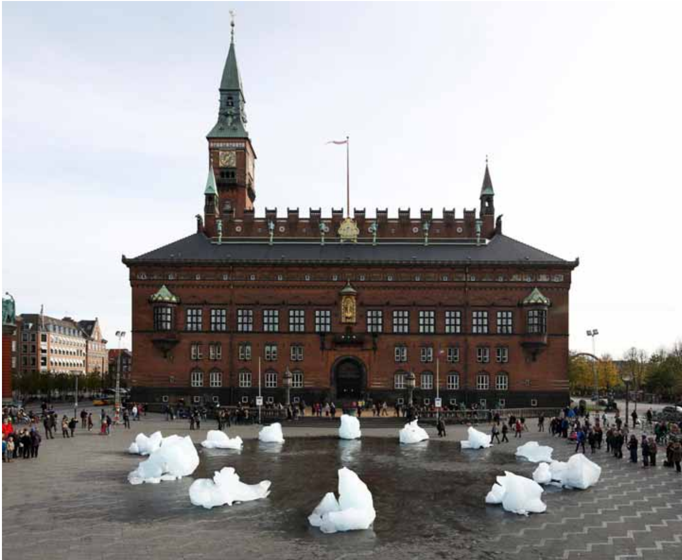
Ice Watch by Olafur Eliasson, 2014 [Fig. 3b] 12 blocks of ice, 100 tonnes of ice City Hall Square, Copenhagen, Denmark