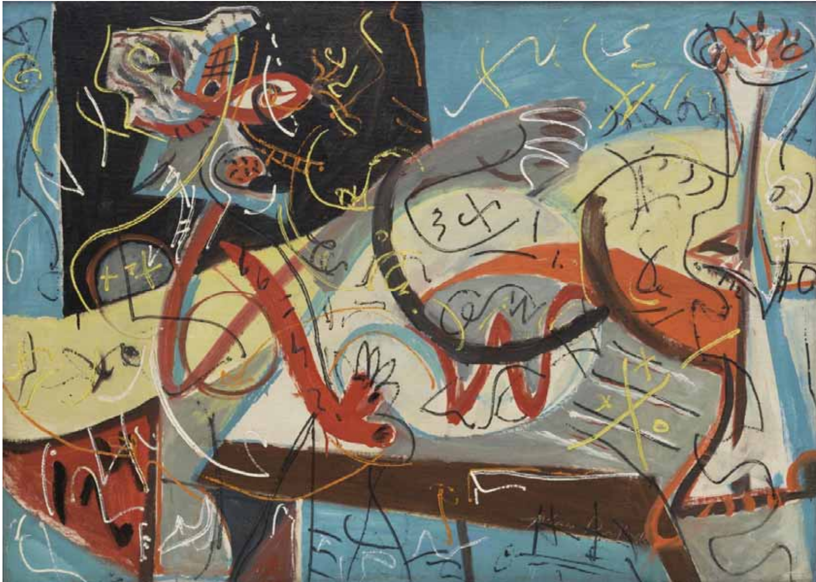
Stenographic Figure by Jackson Pollock, c.1942 [Fig. 4a]