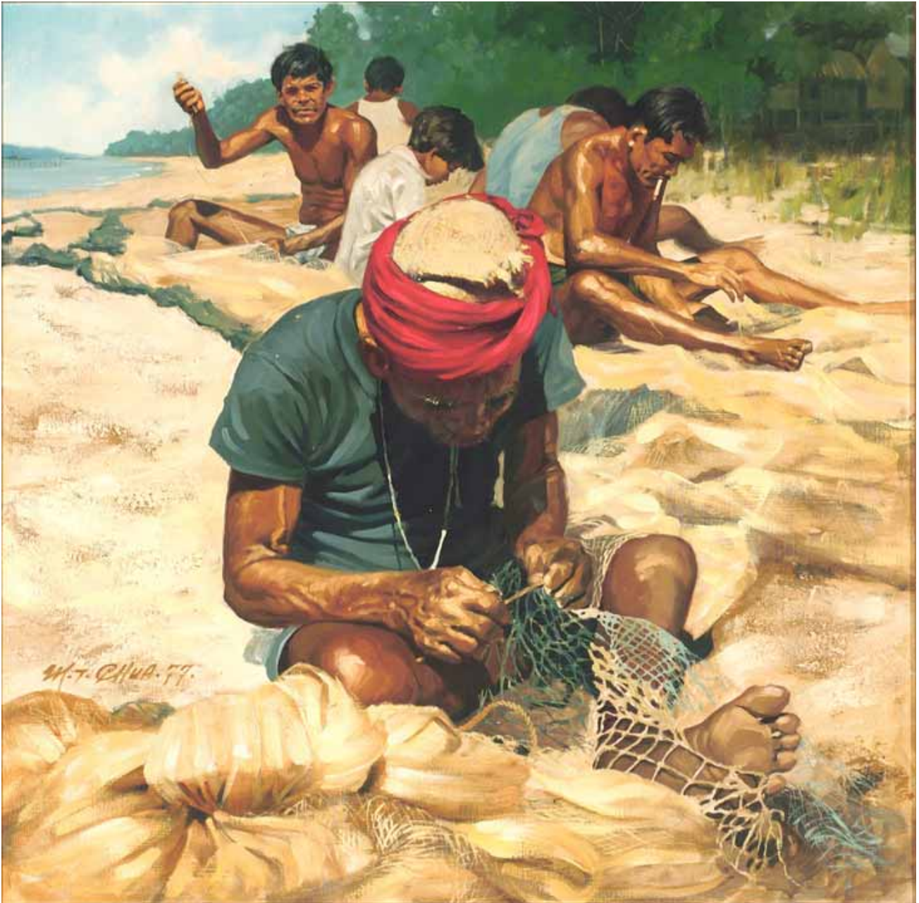
Malay Fisherman at Changi Beach by Chua Mia Tee, 1977 [Fig. 1] Oil on canvas, 78 x 79.5 cm