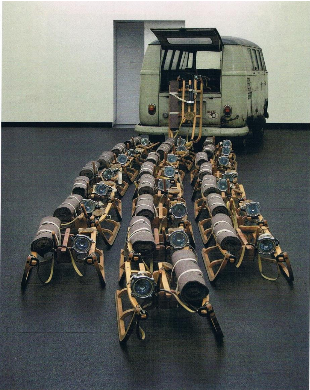
Fig. 1 The Pack by Joseph Beuys 1969 VW Campervan, wool, felt, fat Museumslandschaft Hessen Kassel, Neue Galerie