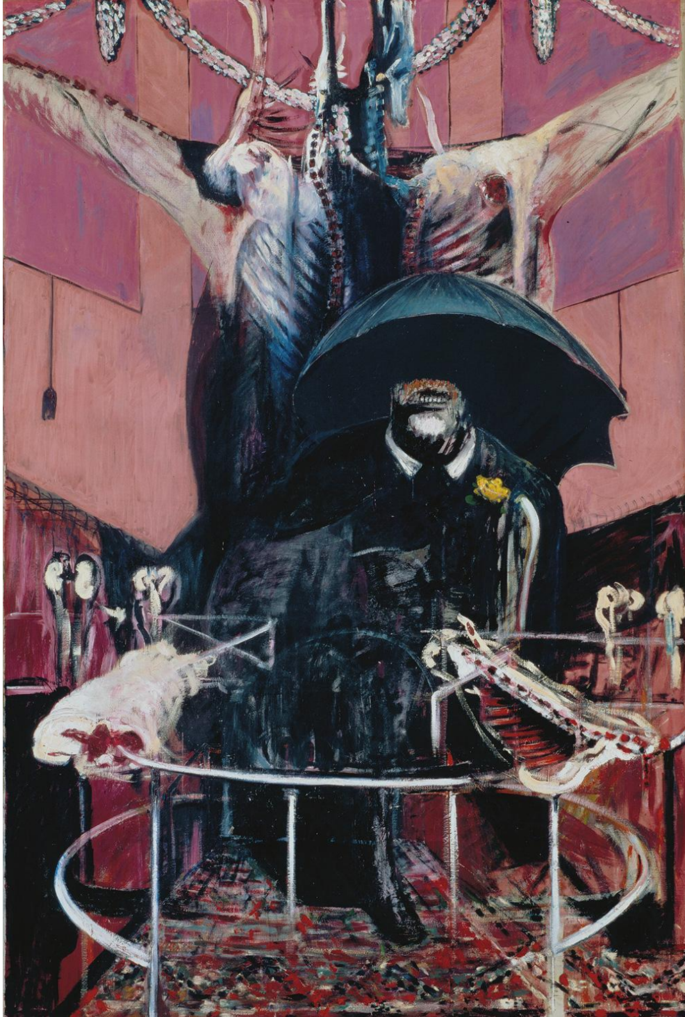
Fig. 3a Painting by Francis Bacon 1946 Oil and tempera on canvas 198 x 132 cm Collection of MOMA