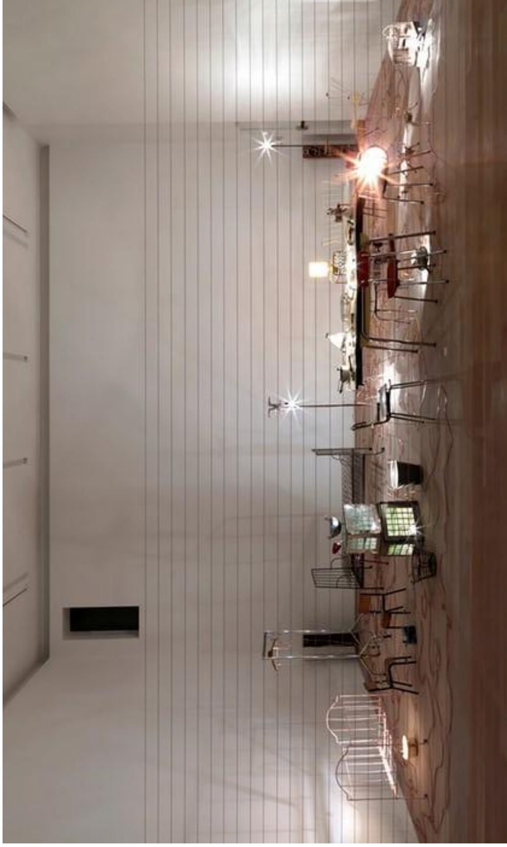
Fig. 2 Homebound (2000) by Mona Hatoum Mixed-media installation with kitchen utensils, furniture, electric wire, light bulbs, computerized dimmer unit, amplifier and speakers. Installation view at Tate Modern London, 2000.