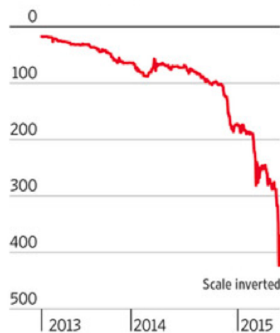
Figure 3: Venezuelan bolivar per US dollar