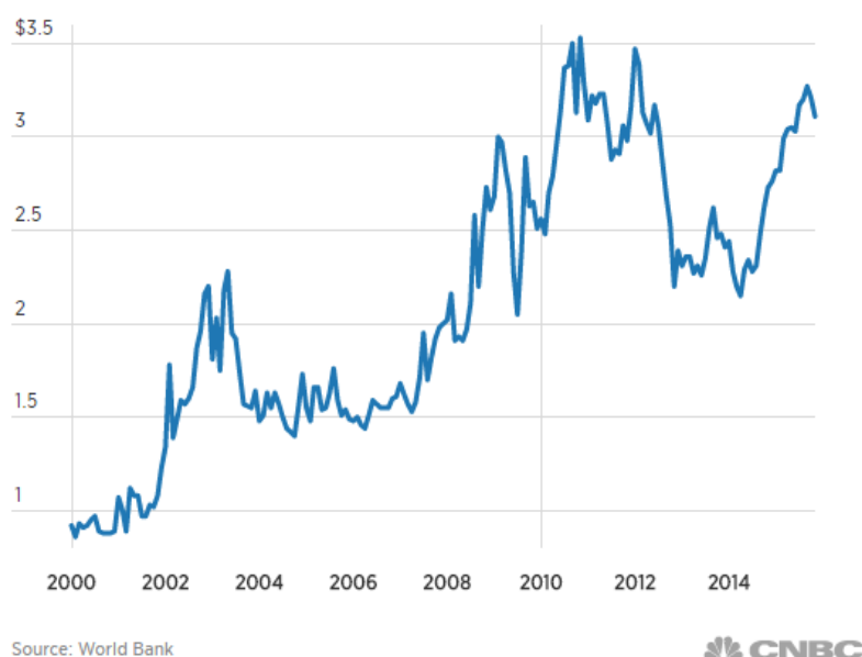
Figure 1: Cocoa Prices from 2000-2014