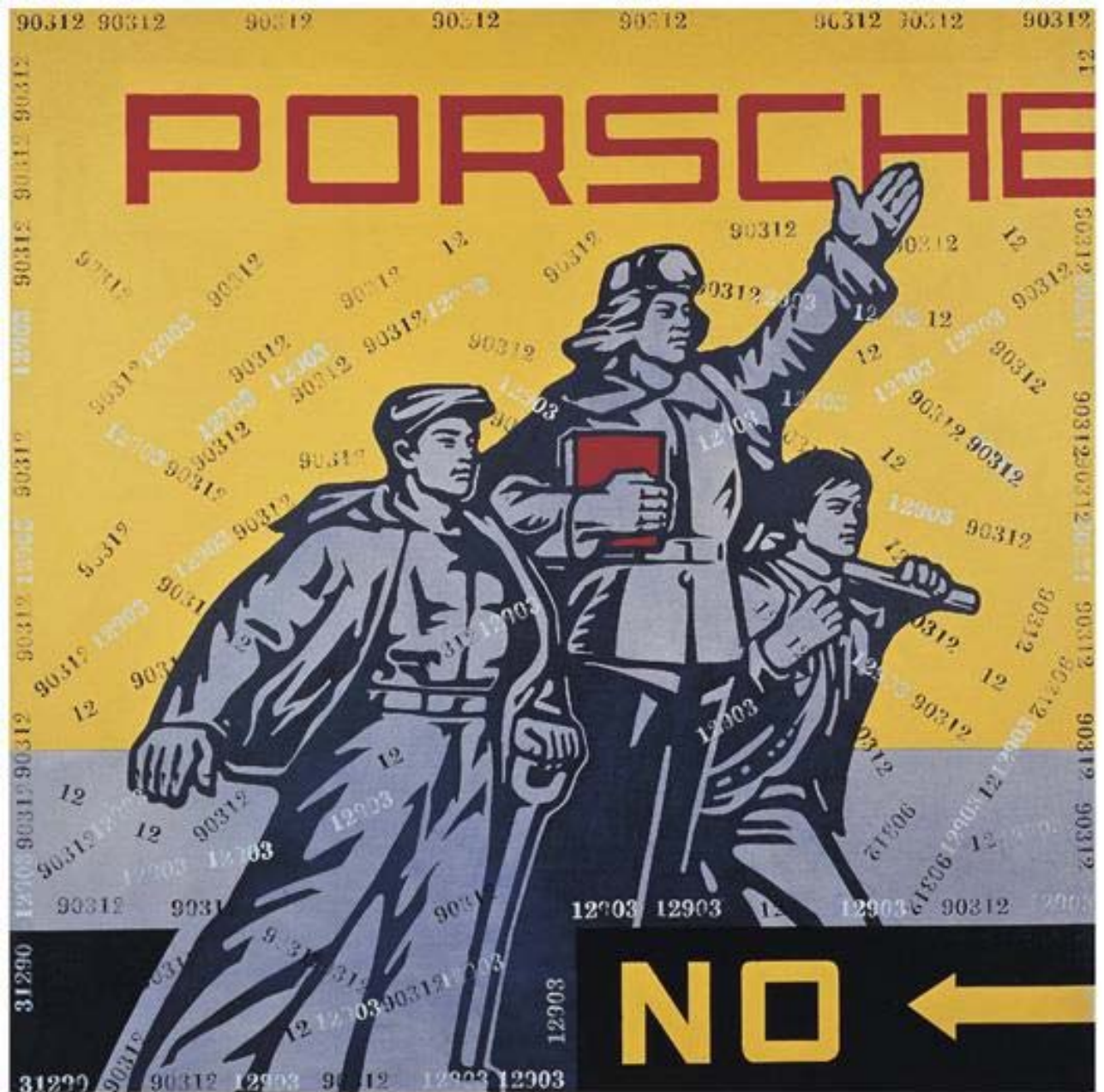
Fig. 1 Porsche by Wang Guangyi, 2005 Oil on canvas. 78 3/4 x 78 3/4 in. (200 x 200 cm) Private Collection