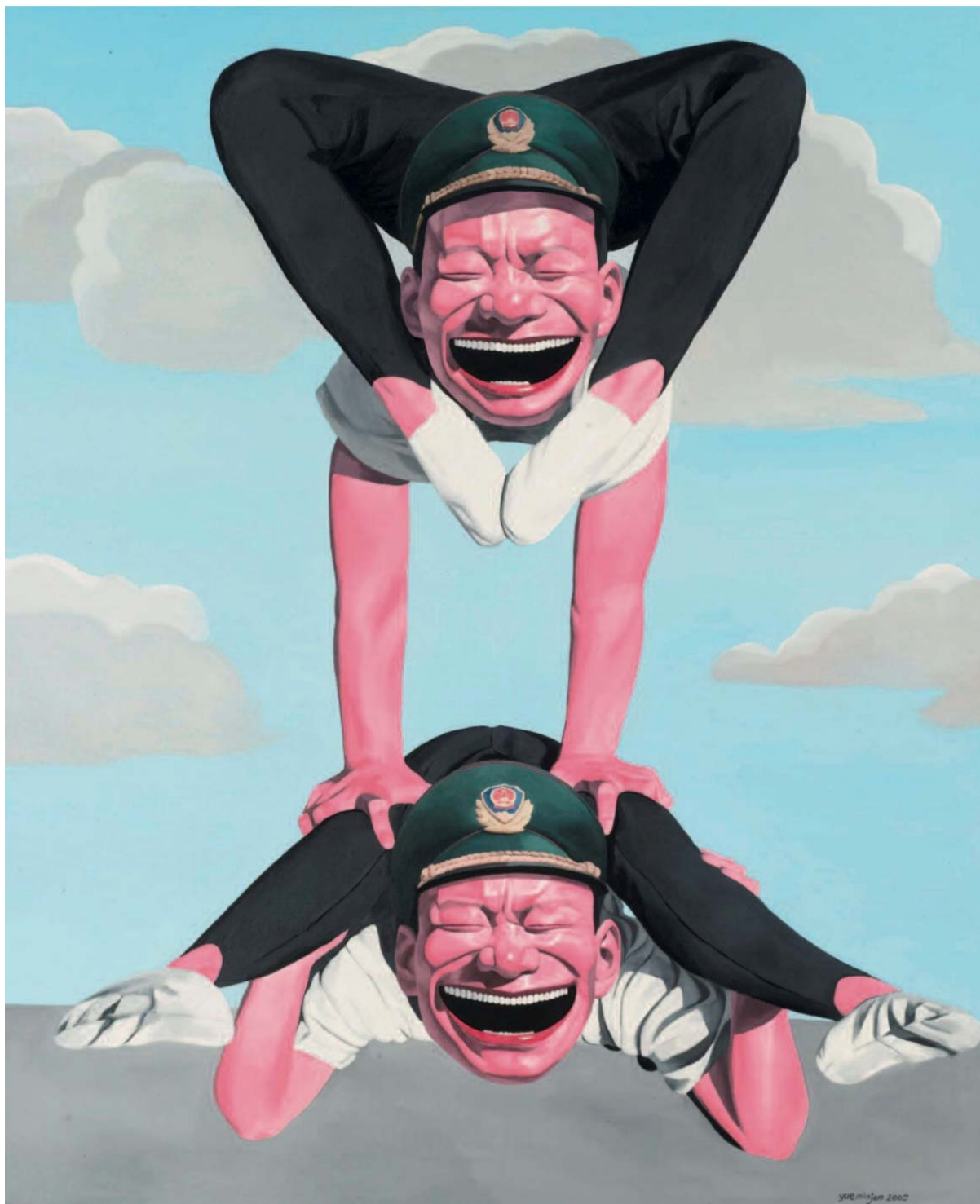
[Fig. 3b] Hat Series- Acrobat , Yue Minjun, 2005, Oil on canvas, 170 x 140 cm.