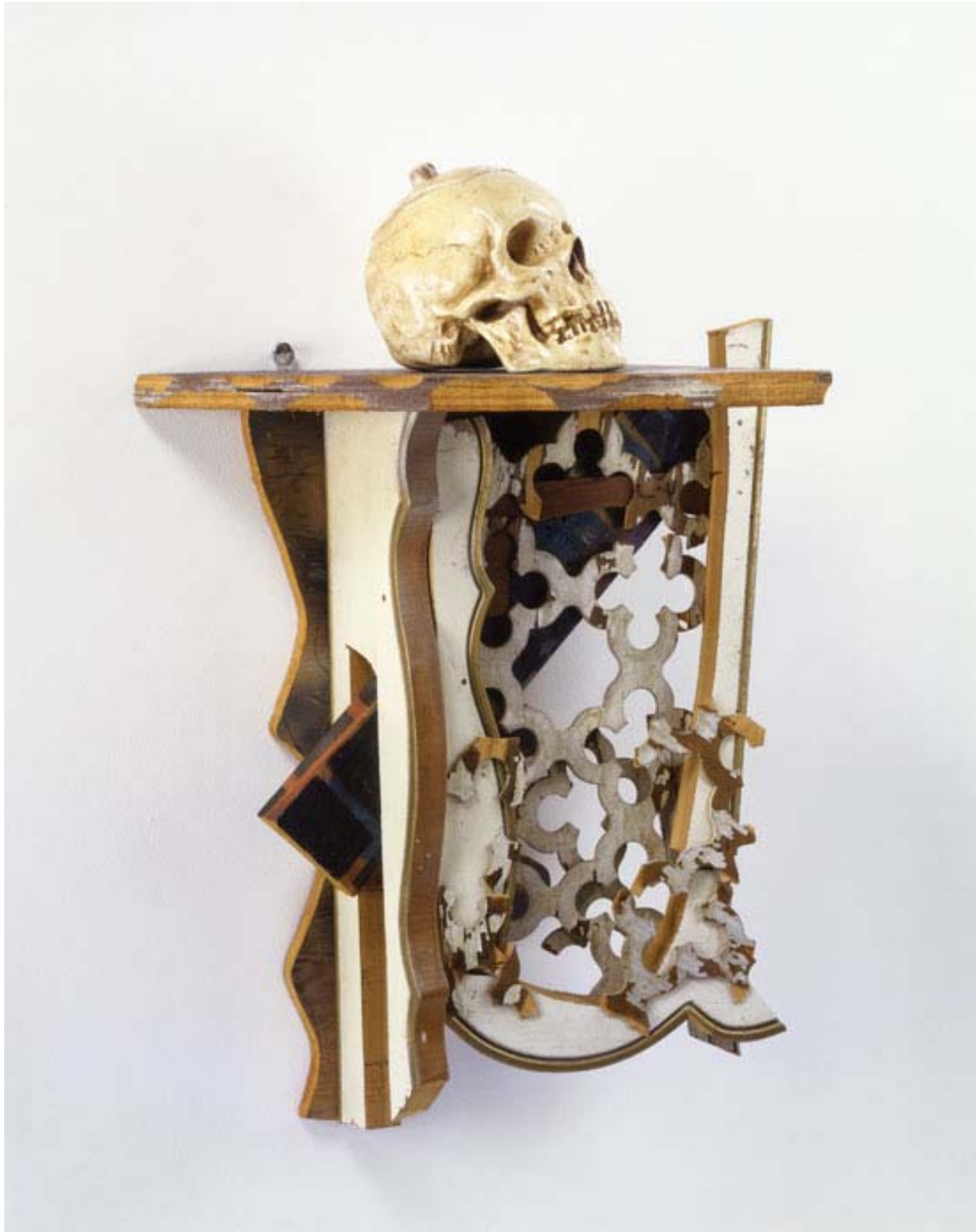
[Fig. 4a] Shelf with Cookie Jar , Haim Steinbach, 1982, Wood, paint, spray paint shelf and plaster, painted skull,