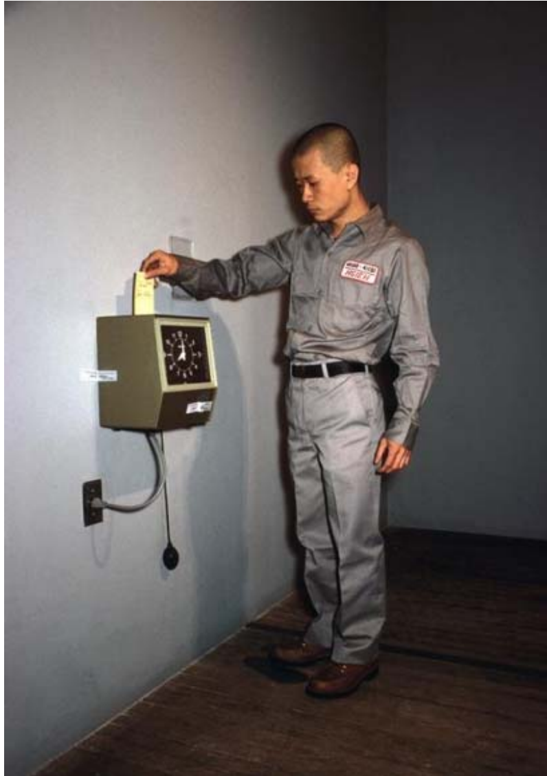
[Fig. 1] One Year Performance 1980-1981 (Time Clock Piece) , Tehching Hsieh, 1980-1981, Poster, an artist's statement and witness statements, a record of missed punches, a time clock, 366 time cards, 16 mm time-lapse film, 366 filmstrips