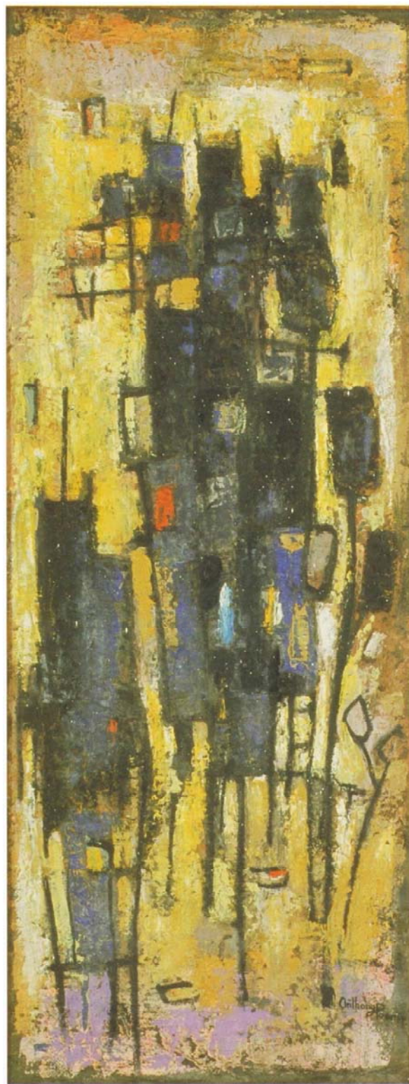
[Fig. 2] Riverside Village , Anthony Poon, 1964, Oil on Hardboard, 83 x 31 cm