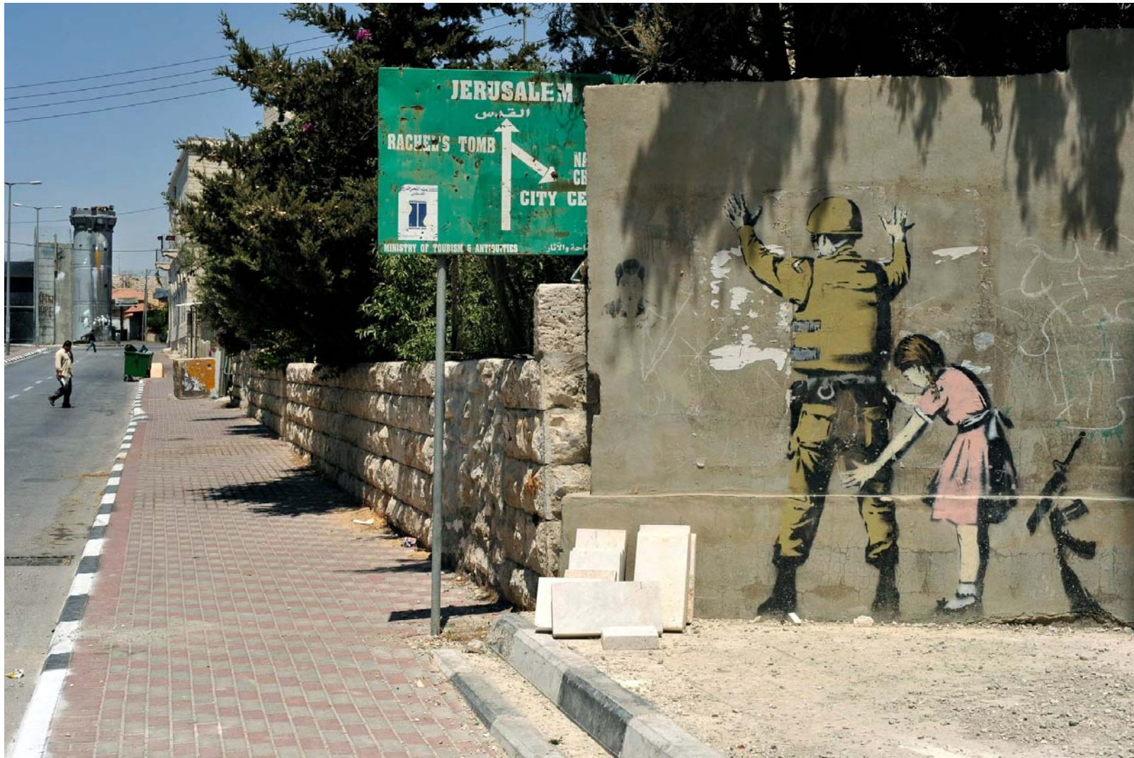
[Fig. 3a] Girl and Soldier , Banksy, 2007, Spray Paint on Wall in Bethlehem, Palestine.