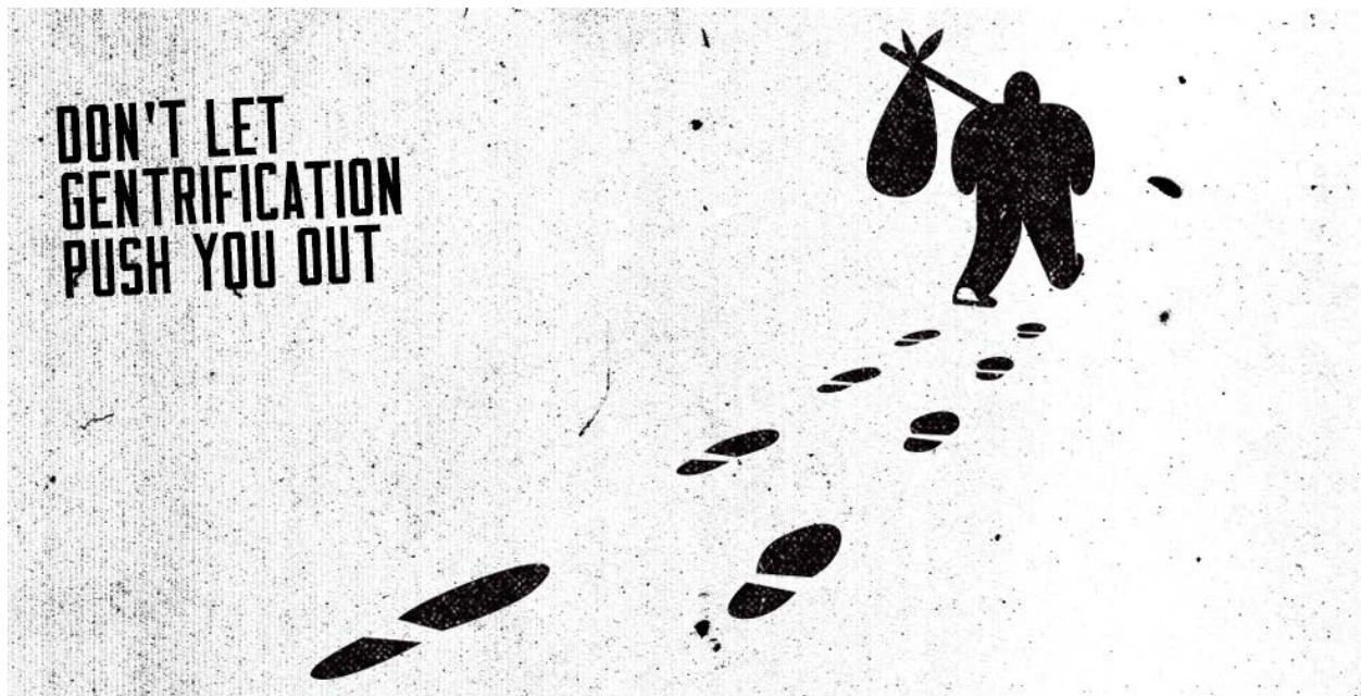
Fig. 3E: Alternative views of proposed Gentrification on Greenpoint, New York

YOU CAN MAKE A DIFFERENCE!!! It's not too late! Please sign our petition & join our mailing list for updates, at www.savegreenpoint.org