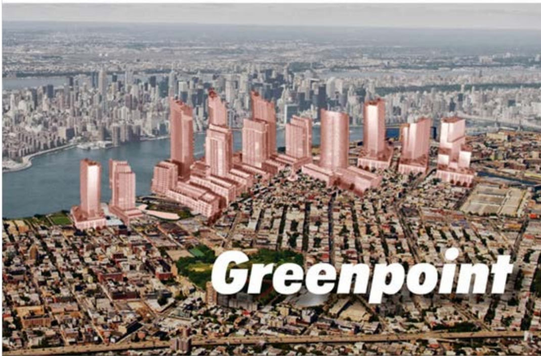
Fig. 3C: Impact of gentrification or non-gentrification on neighbourhoods in New York from 2000-2007