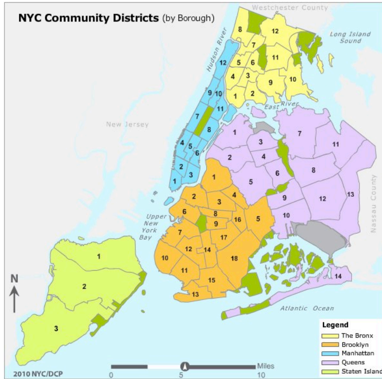
Fig. 3A: Location of Greenpoint (labelled as District 1 in the Borough of Brooklyn) in New York,