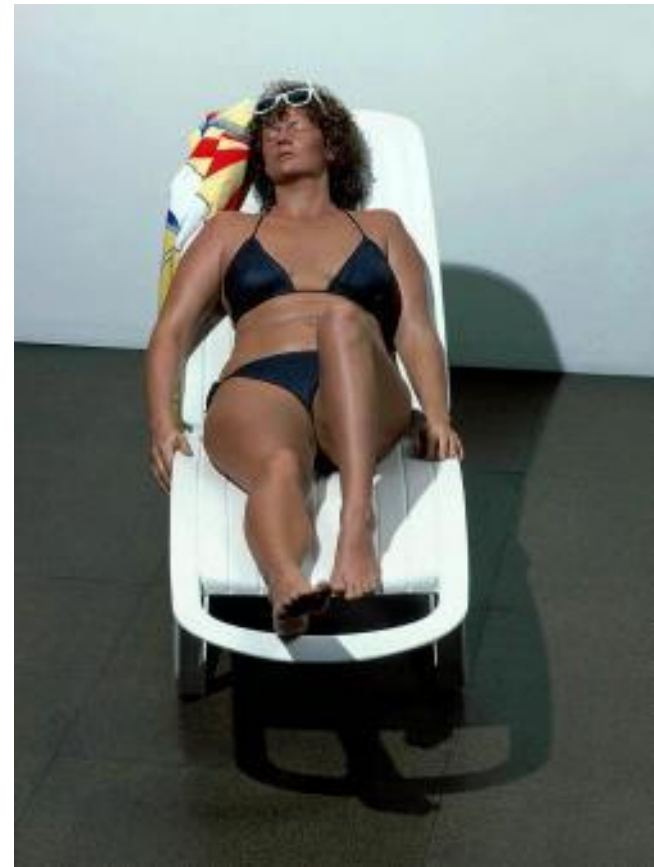
[Fig. 3a] Sunbather with Black Bikini by Duane Hanson, 1989 Polychromed bronze, with accessories, Life size Saatchi Gallery, London