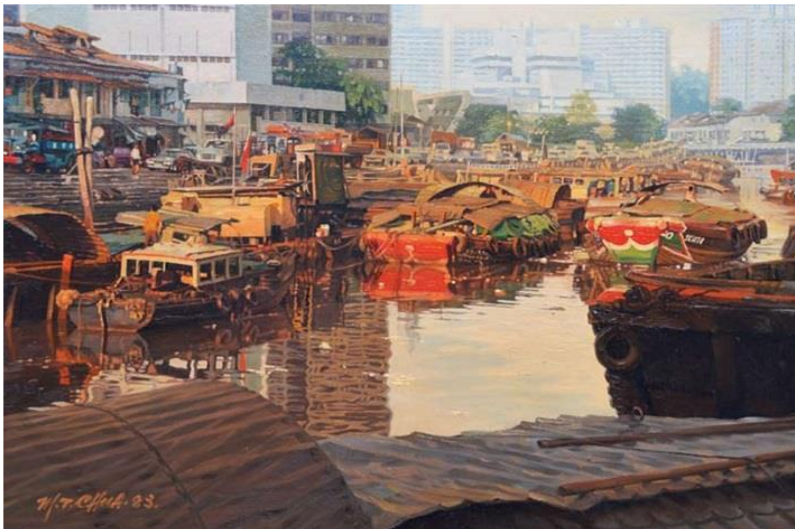
[Fig. 4b] Singapore River Scene by Chua Mia Tee, 1983 Oil on Canvas 61 x 91.5cm