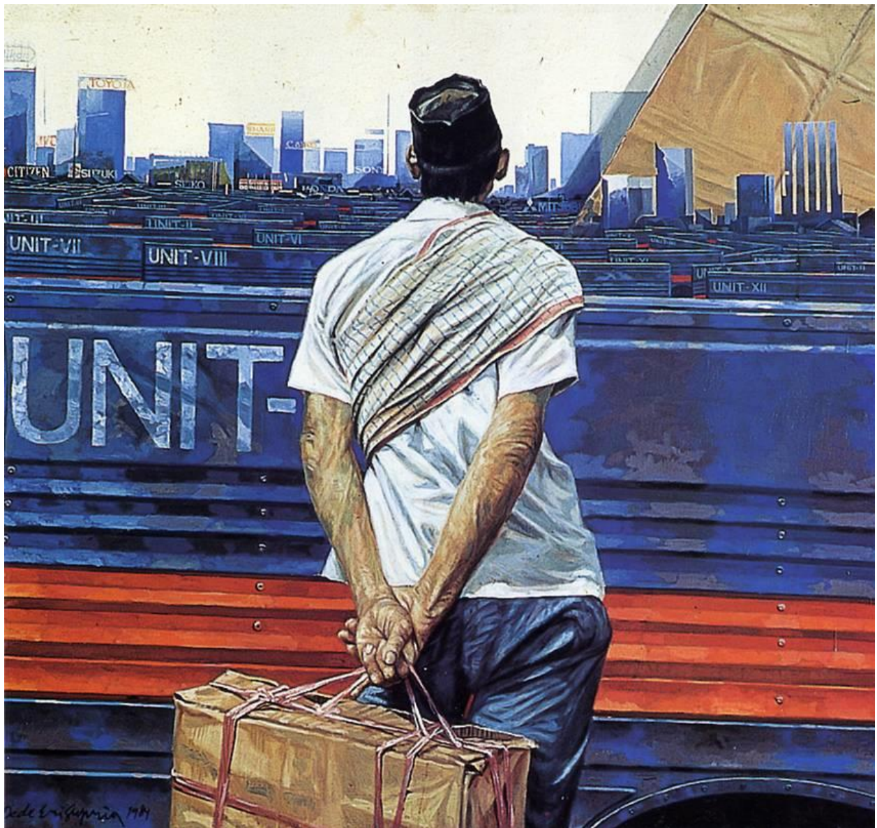
[Fig.2] Between the Buses by Dede Eri Supria, 1984 [Fig.2] Oil on canvas, 100 x 110 cm