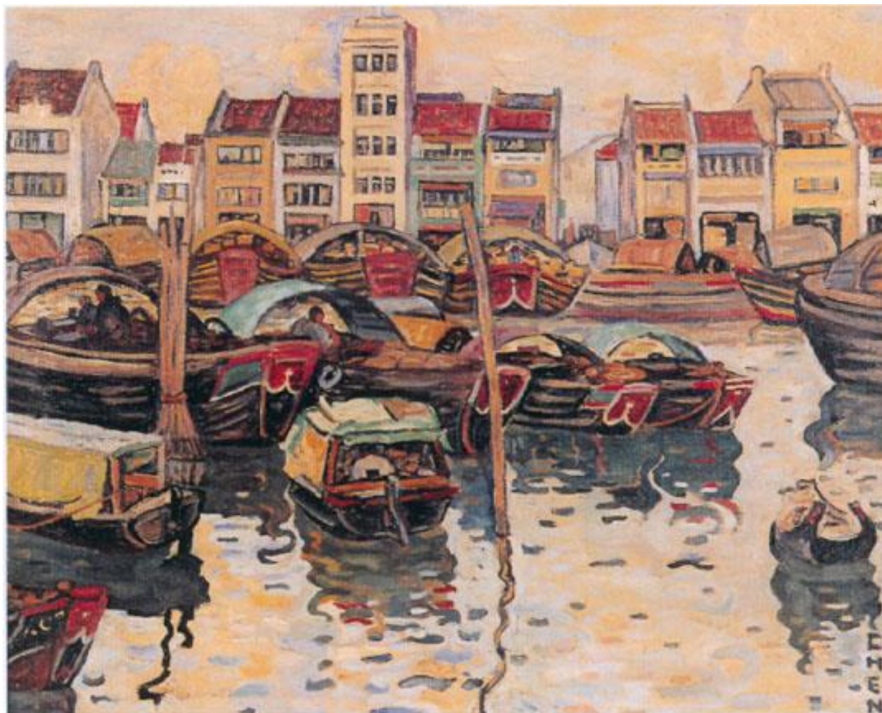
[Fig. 4a] Singapore Waterfront by Georgette Chen, 1958 Oil on Canvas 59 x 72cm