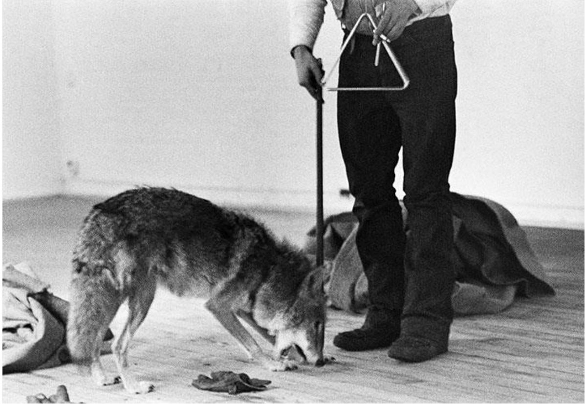
Fig. 1: I Like America and America Likes Me by Joseph Beuys 1974 Performance art with photo documentation René Block Gallery, New York