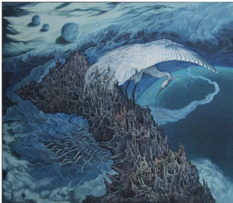
Caught in a Barrier of Sharp Rock by Lucia Hartini, 1992. Oil on canvas 200 x 230 cm © 2015 IndoArtNow Gallery