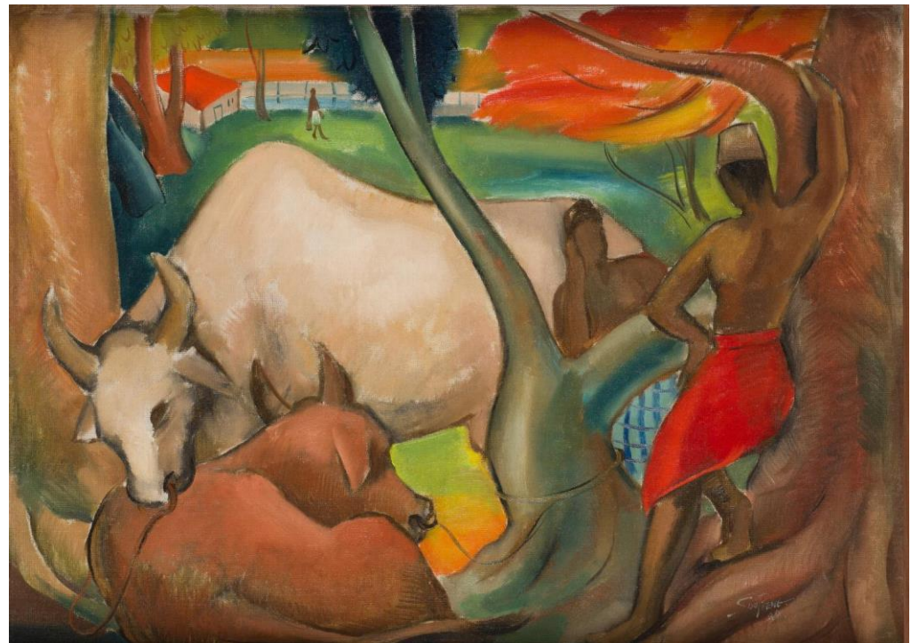
Indian Men with Two Cows by Cheong Soo Pieng, 1949. Oil on canvas marouflaged onto masonite board 75.3 x 104.5 cm Collection of National Gallery Singapore