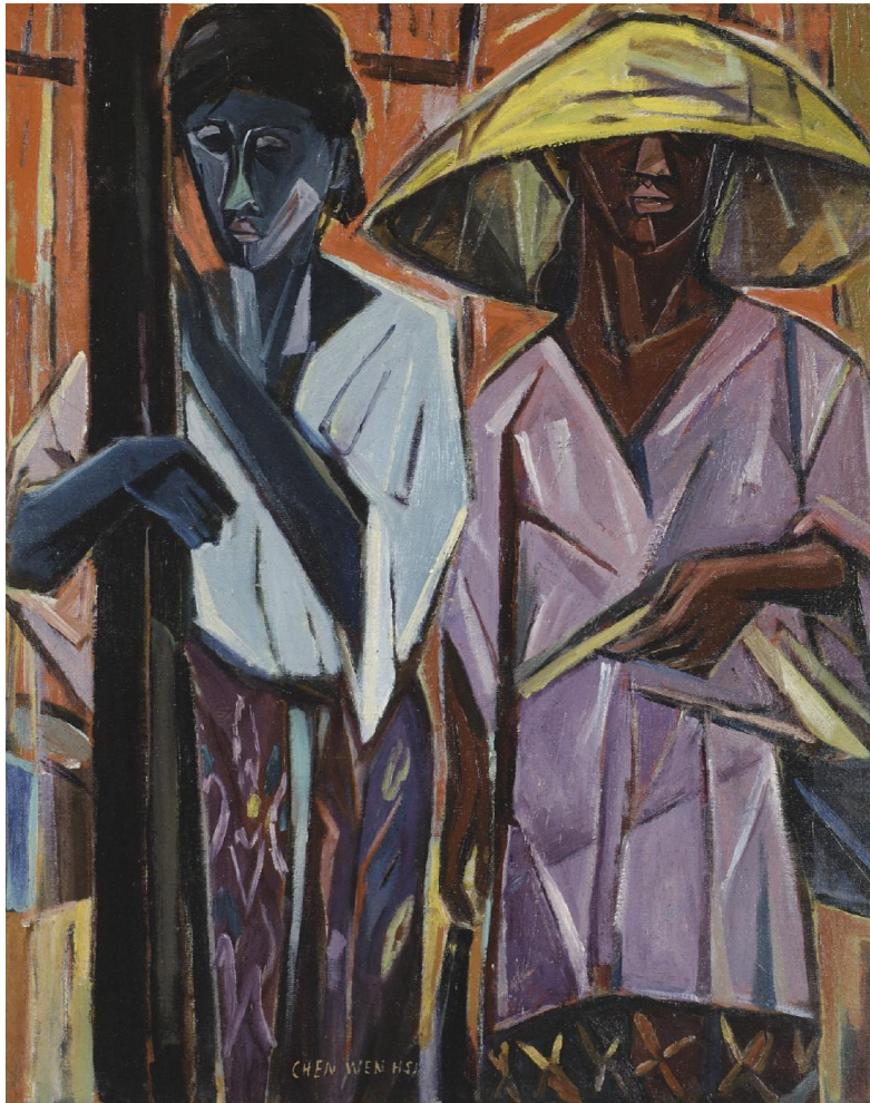
Two Figures by Chen Wen His, c.1950s. 74.5 x 59.4 cm Oil on Canvas Collection of Singapore Art Museum