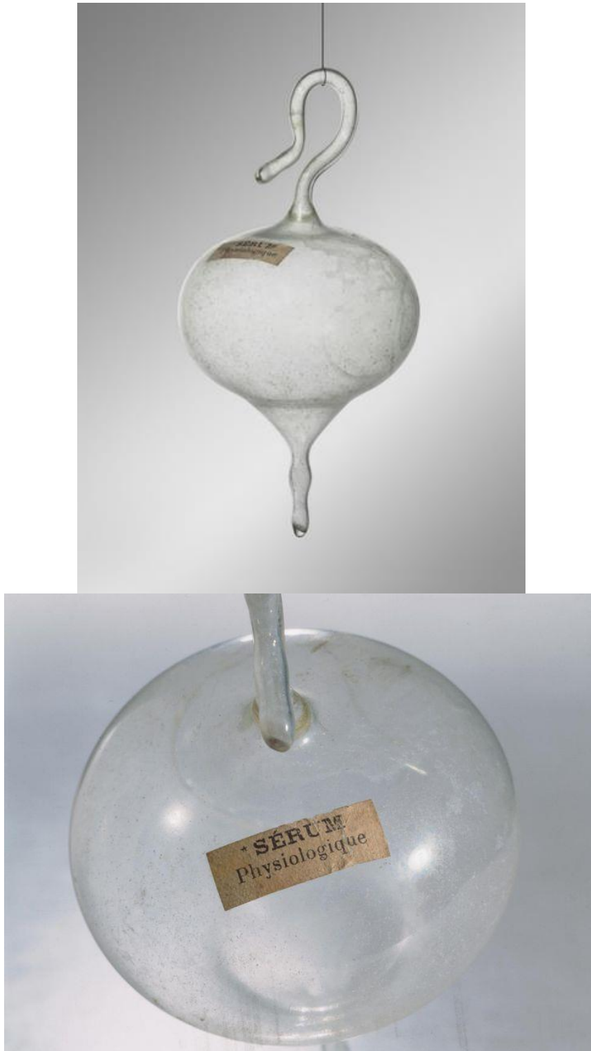
50cc of Paris Air by Marcel Duchamp, 1919 Glass ampoule (broken and later restored) Height: 13.3 cm Collection of Philadelphia Museum of Art