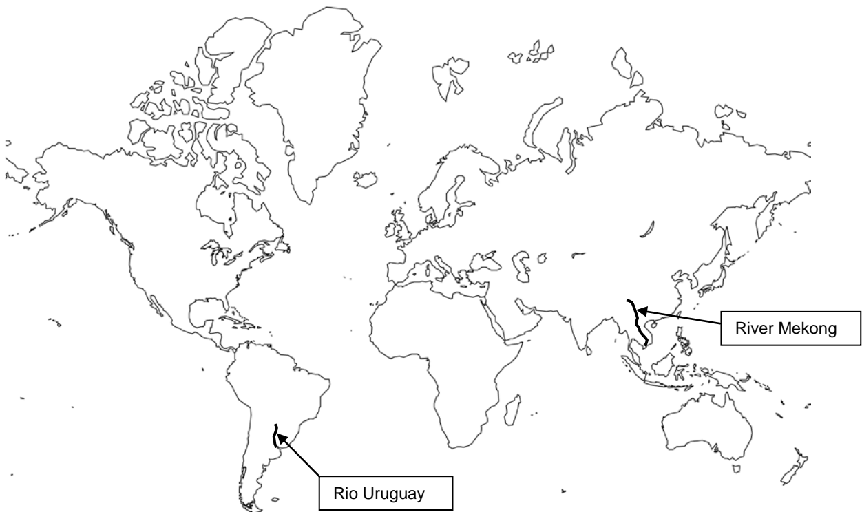
Fig 2B for Question 3 Locations of Rio Uruguay and Mekong River