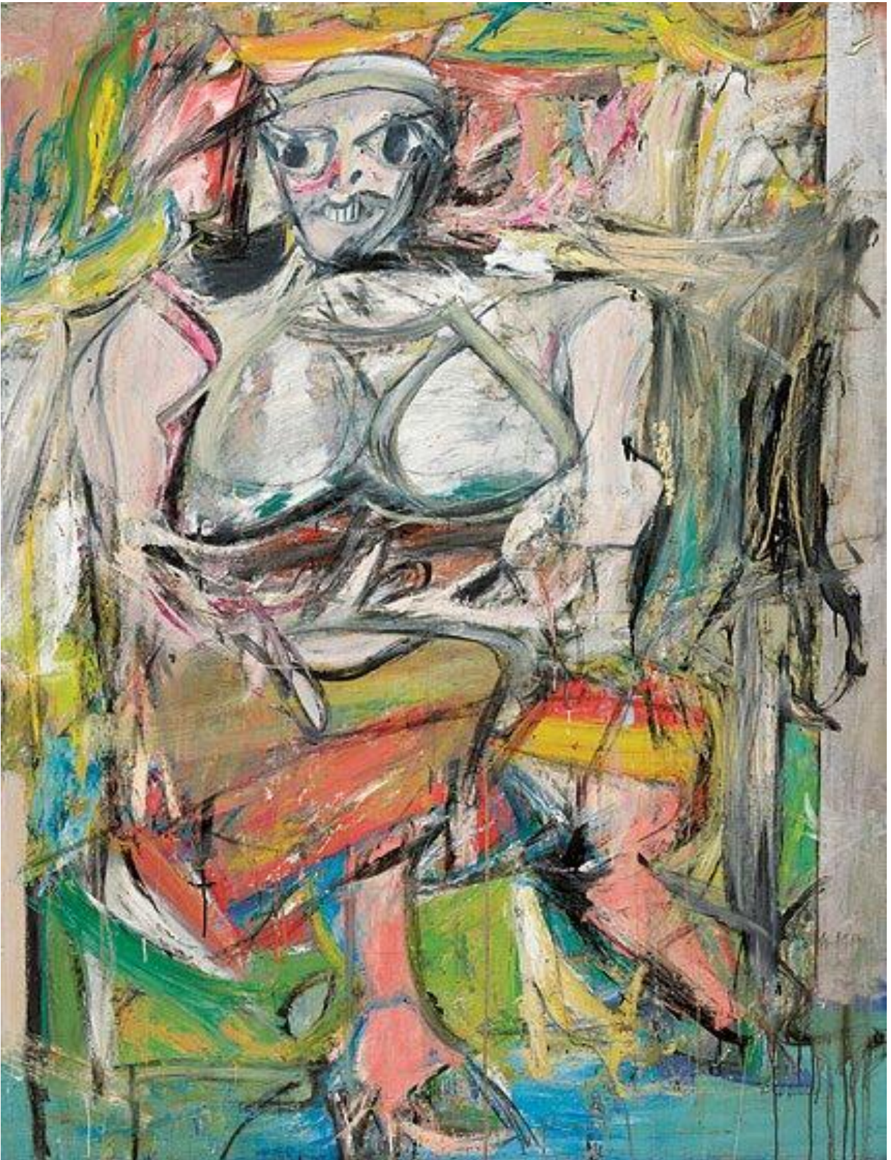
[Fig. 4b] Woman I 1950-52 by Willem De Kooning, Oil on canvas 192.7 x 147.3 cm