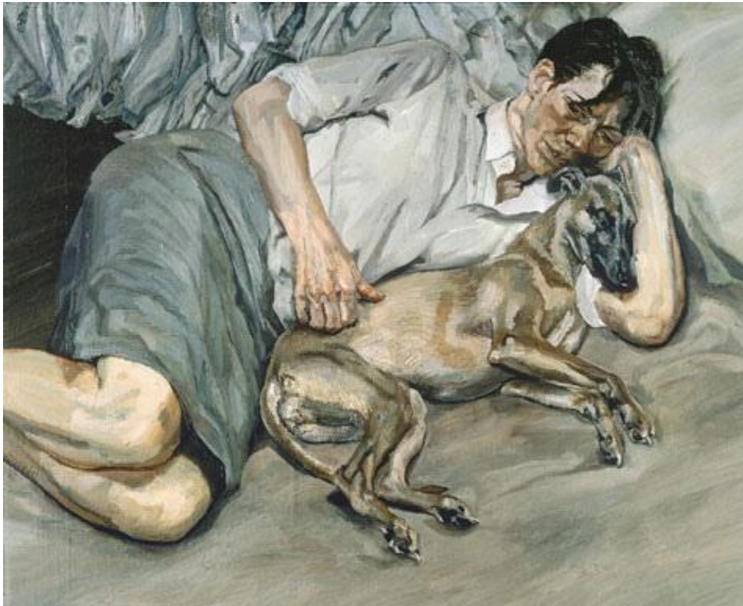
[Fig. 4a] Double Portrait 1988-90 by Lucien Freud, Oil on canvas 113 x 134.5cm