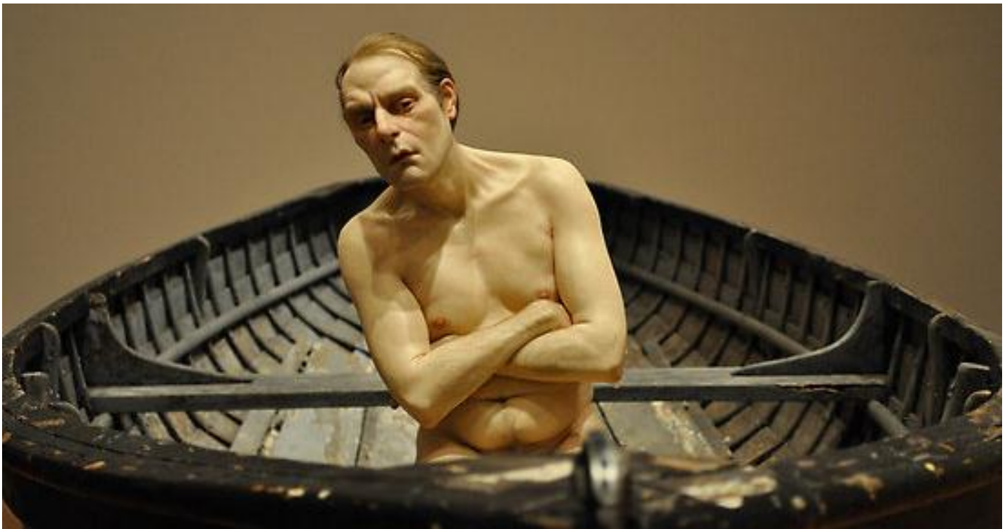
[Fig. 1] Man in a Boat 2002 by Ron Mueck, Mixed Media 420 x 137 x120 cm