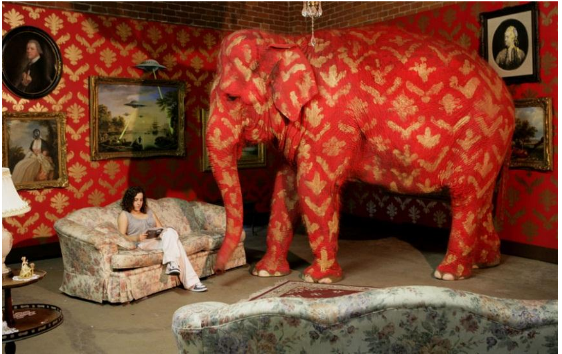
[Fig. 3b] Elephant in the Room 2006 by Banksy, Victorian-styled furniture, paintings, carpet and elephant Size variable