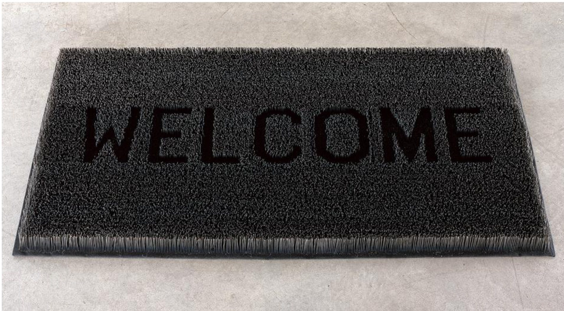
[Fig. 2] Doormat II 1996 by Mona Hatoum, Stainless steel and nickel plated pins, glue and canvas 70 x 40 x 2.5 cm