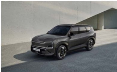
Shale Grey with Black Roof