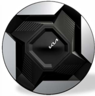
19" Alloy (Earth)