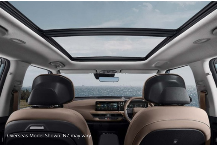
Overseas Model Shown. NZ may vary.

Inside, the EV5 cares for you and the planet, with extensive use of recycled and sustainable materials throughout. With an additional segment display positioned between dual 12.3" screens, the EV5's integrated panoramic display spans a huge 29.6", giving you panoramic view and complete control over essential vehicle functions.