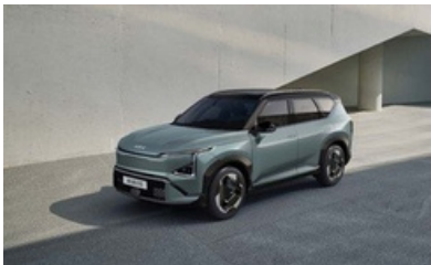
Iceberg Green with Black Roof