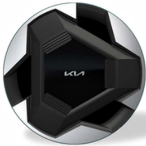
18" Alloy (Light & Light+)

Striking and dynamic, the EV5's wheel covers are also functional, designed to maximise electric range.