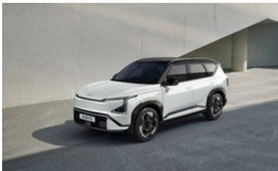
Snow White Pearl with Black Roof