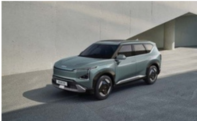
Iceberg Green Matte