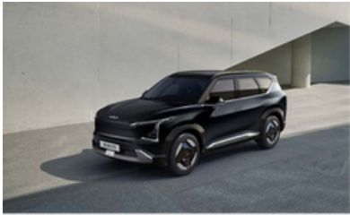
Starry Night Black