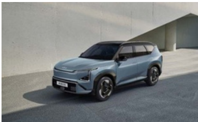
Frost Blue with Black Roof