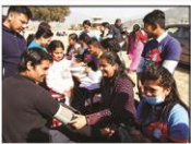
Mulpani Health Camp