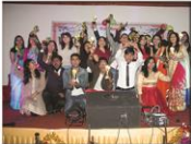
Bachelors' Welcome and Farewell Program 2073