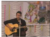
Cultural Program at Saraswati Pooja