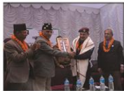
Awareness Program at our college premises 'Police My Friend'