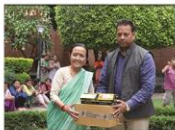
President of Maiti Nepal - Anuradha Koirala receiving stationery and grocery items