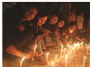
Lighting Candles on Constitution Day