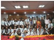
Experience Sharing Program