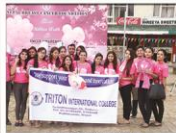
Cancer Awareness Program on Cancer Day