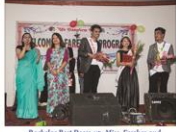
Bachelor Best Dress-up, Miss, Fresher and Mr. Fresher - 2073