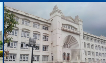
Mody University of Science and Technology, Rajasthan, India