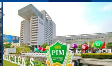
Panyapiwat Institute of Management, Nonthaburi, Thailand