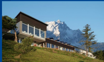
International Management Institute (IMI), Luzern, Switzerland

FOUR YEARS IN NEPAL OR TWO YEARS IN NEPAL AND TWO YEARS IN PARTNER INSTITUTION