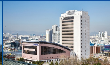
SolBridge International School of Business, Daejeon, S. Korea