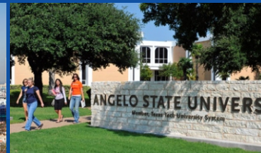
Angelo State University (ASU), San Angelo, Texas, USA