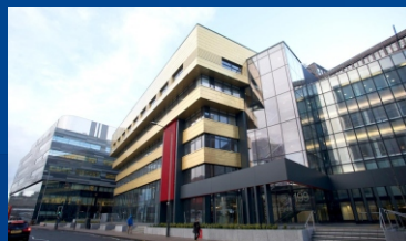
Strathclyde Business School of Strathclyde University, Glasgow, UK