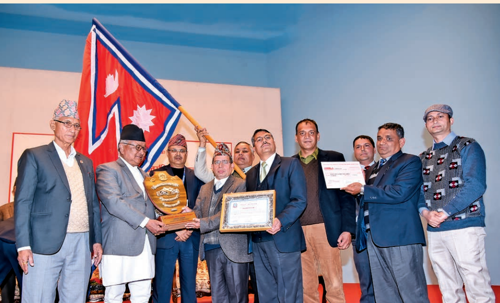
KMSS, Bagbazar has been honoured by prestigious Educational Award 2074 by the Ministry of Education, Nepal for its outstanding results in Grade XII among the private schools of Nepal.