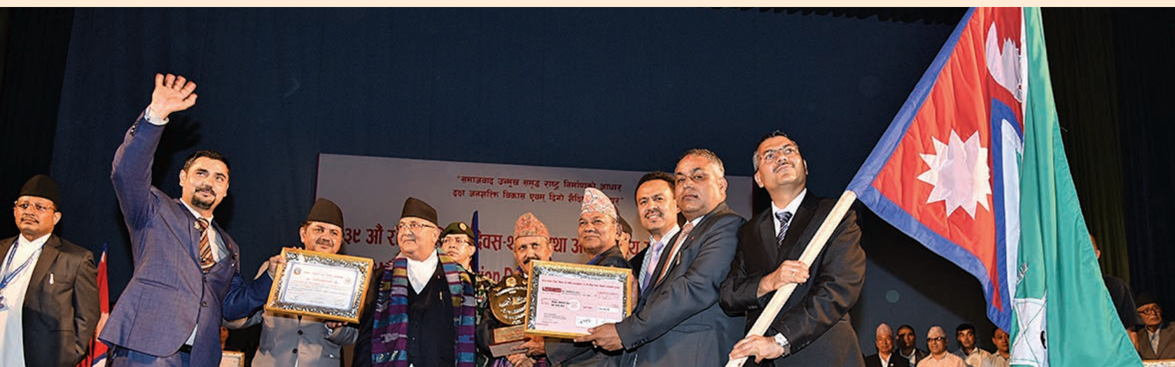
KMSS, Lalitpur has been honoured by prestigious Educational Award 2075 by the Ministry of Education, Nepal for its outstanding results in Grade XII among the private schools of Nepal.