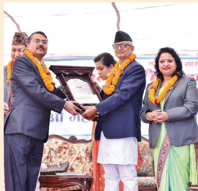
KMC School has been honoured by prestigious Educational Award by the Kathmandu Metropolitan City in 2075, for its outstanding results in SEE among the private schools of Nepal.