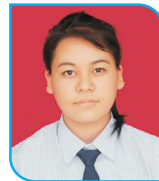
Sanju Thing (3.6) Model School