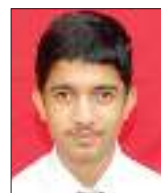
PRAVAT NEPAL 78.60% SCIENCE