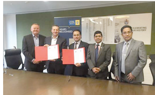
ICAN President signing the agreement with CPA Australia