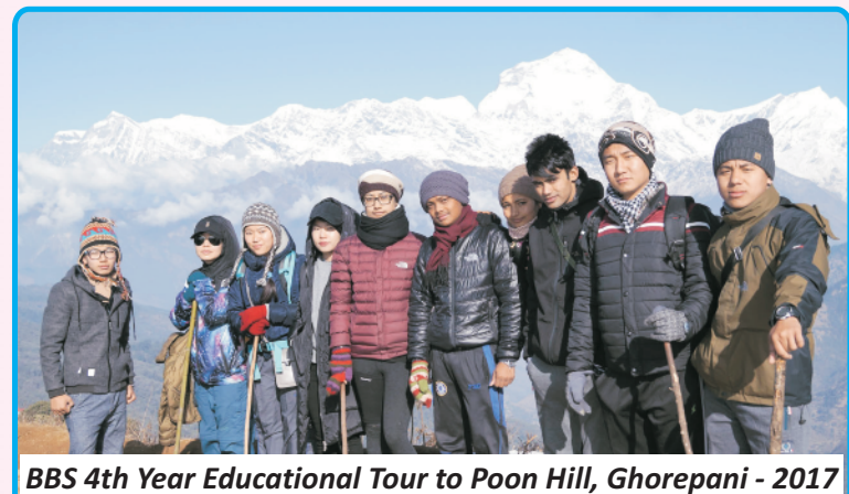
BBS 4th Year Educational Tour to Poon Hill, Ghorepani - 2017