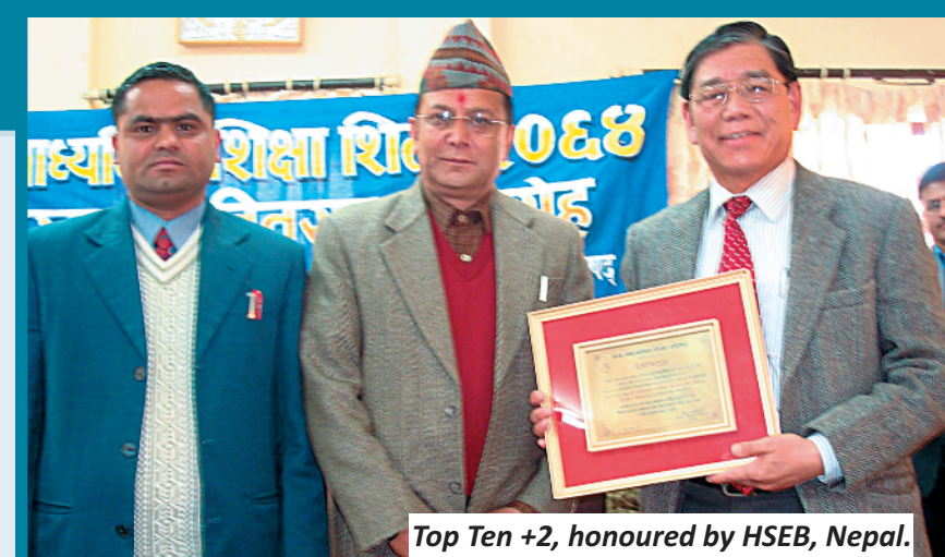
Top Ten +2, honoured by HSEB, Nepal.

Achievements of our ex-students in higher studies within Nepal and abroad are the true yardsticks of our success.