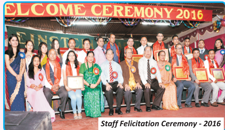
Staff Felicitation Ceremony - 2016