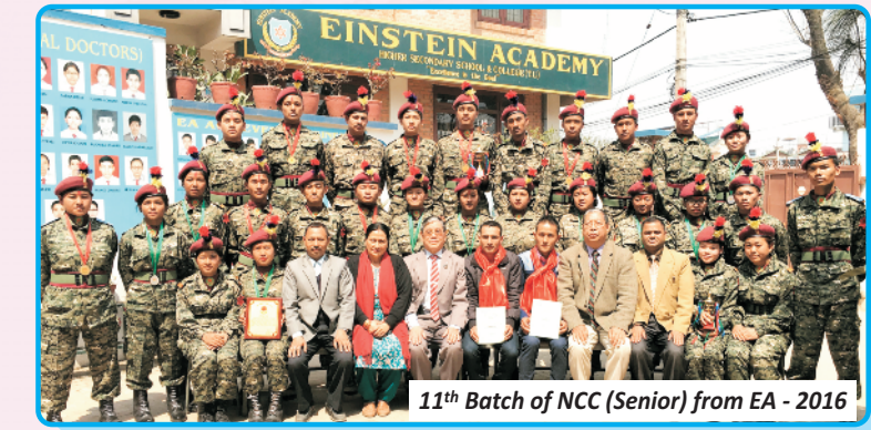
11 th Batch of NCC (Senior) from EA - 2016

The College arranges special lectures from distinguished personalities from different walks of life to inspire and assist the students on credit and non-credit courses.