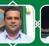
Kosir Rijal Computer