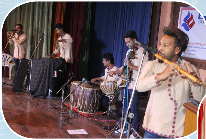
The Sakshyam Band