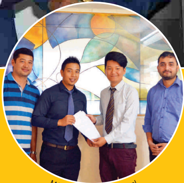
MOU with Teach for Nepal