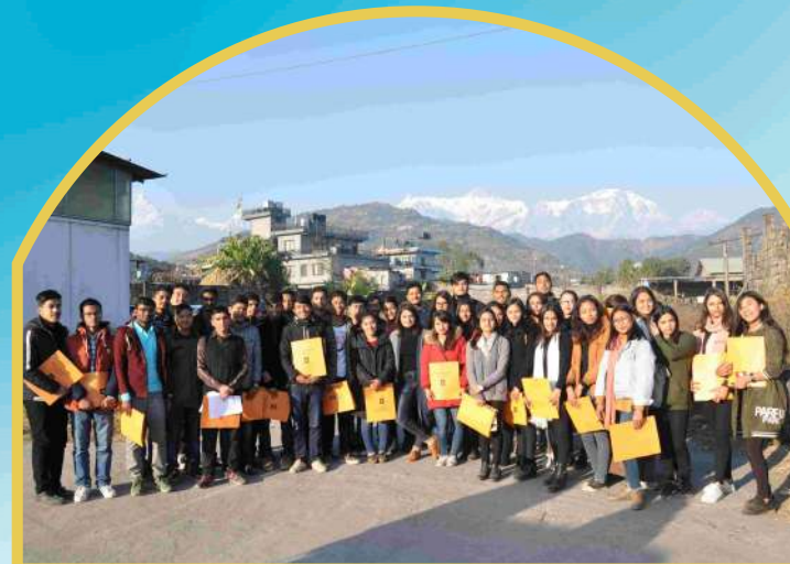
Educational cum Industrial visit to Pokhara: BBA 1 st Semester