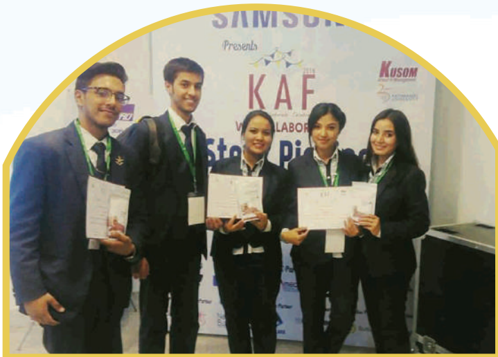
Winner-Stock Picking Competition