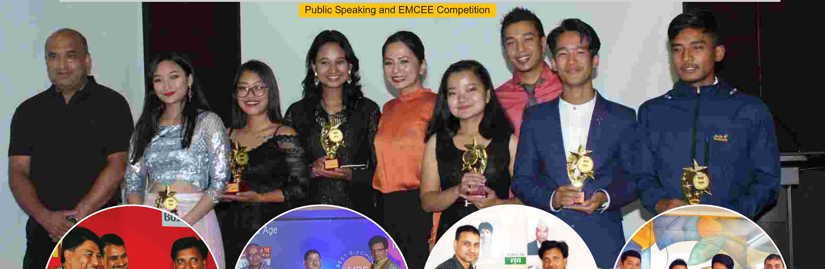
Public Speaking and EMCEE Competition