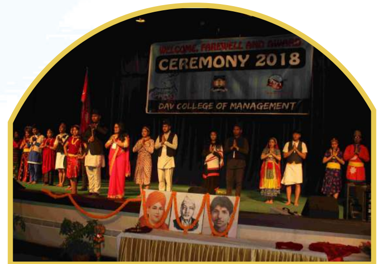
Welcome, Farewell and Award Distribution Ceremony