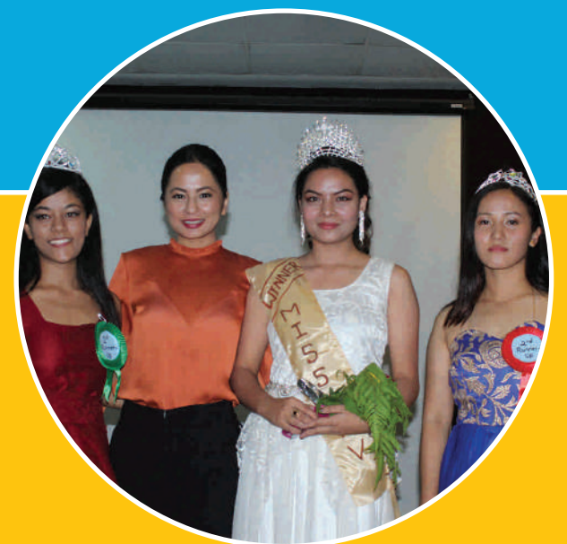
Programs organized with the initiation of Student Clubs