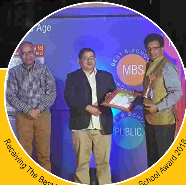
Receiving The Best Undergraduate Business School Award 2018