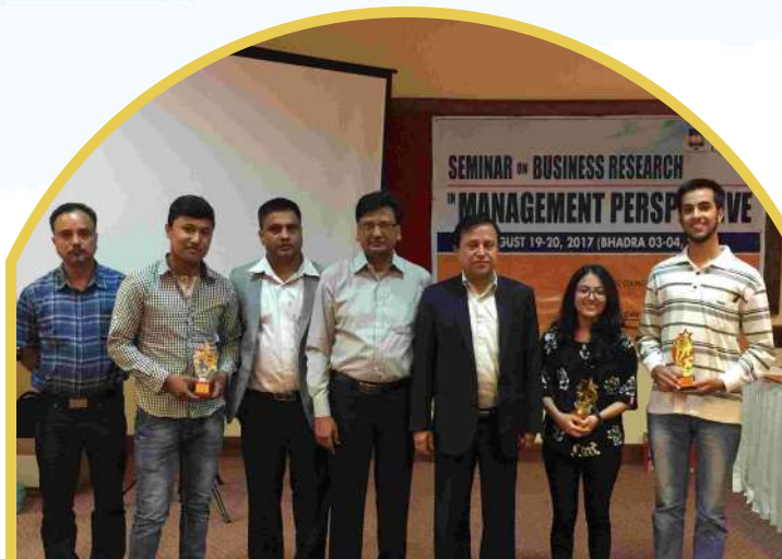
Seminar on Management Perspective in Business Research: BBA 6 th Semester