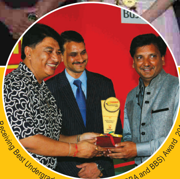
Receiving Best Undergraduate Business School (BBA and BBS) Award 2014