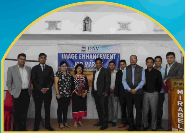
Image Enhancement Programme