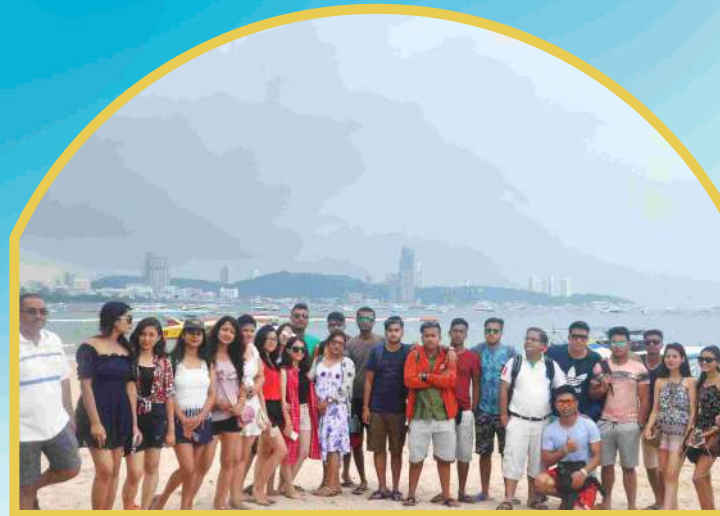
International Tour : Bangkok