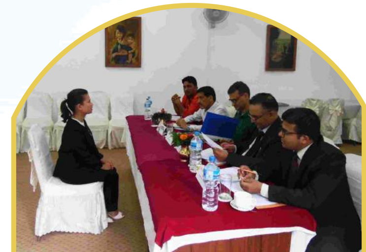
Image Enhancement for Job Market Programme: BBA 8 th Semester Mock Interview