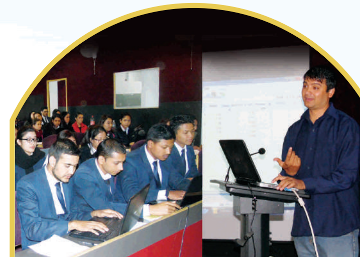
SPSS Training - BBA 7 th Semester