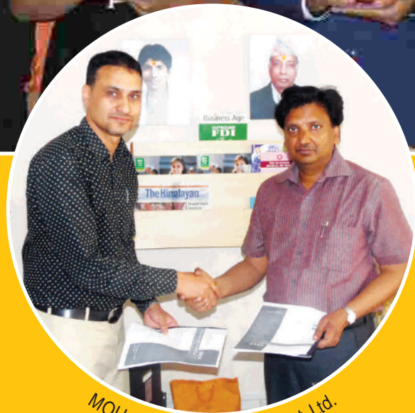
MOU with Growth Sellers Pvt. Ltd.