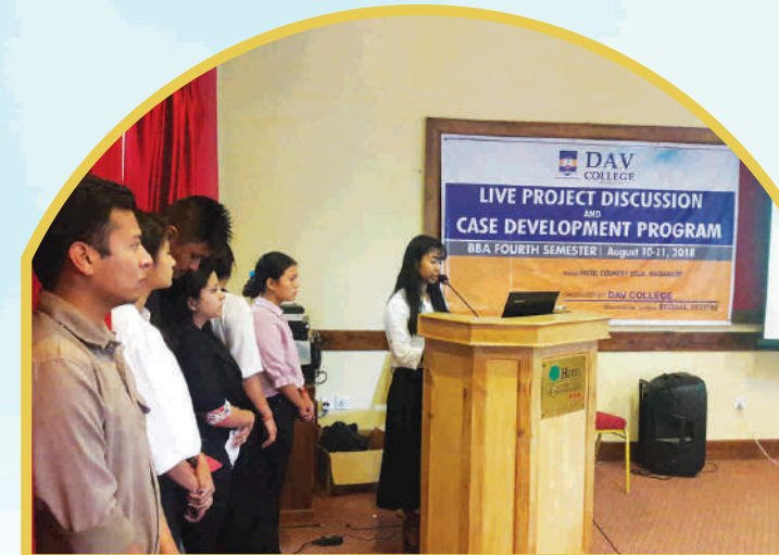
Live Project -BBA 4 th Semester