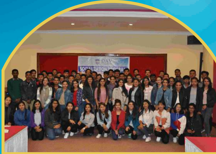
Socialization Programme: BBA 1 st Semester