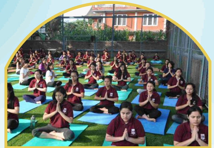
Yoga and Meditation