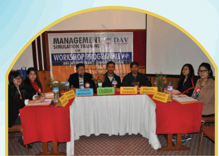
Management Simulation Training cum Workshop Programme (MSTP): BBA 2 nd Semester