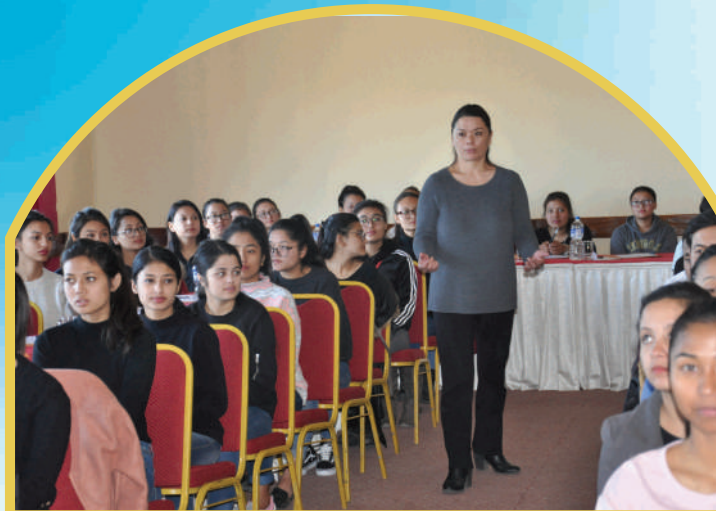
Personality Development Programme: BBA 3 rd Semester