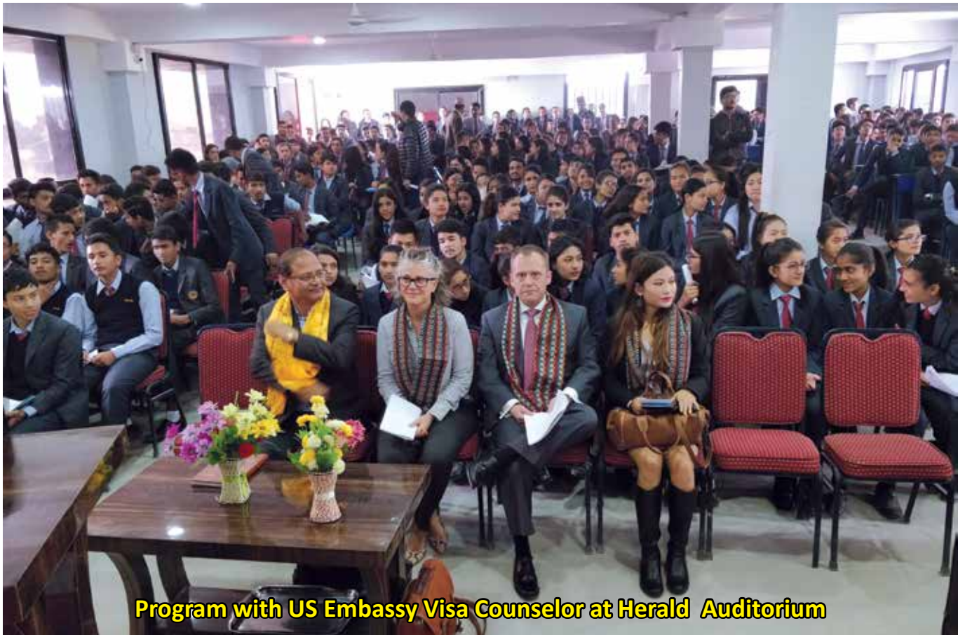
Program with US Embassy Visa Counselor at Herald Auditorium