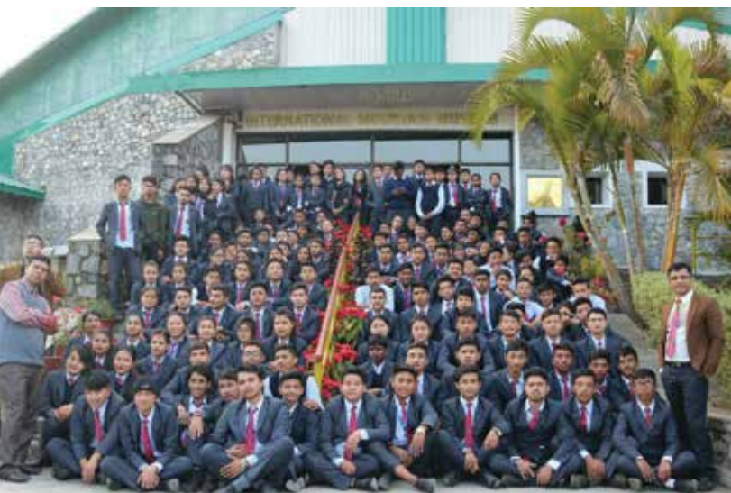
Hotel Mgmt. Practical Tour