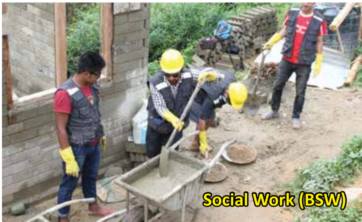
Social Work (BSW)