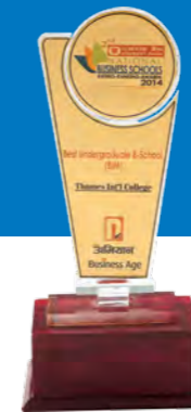
Best Undergraduate B-School (BIM) 2014