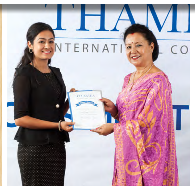
Director's Merit Award