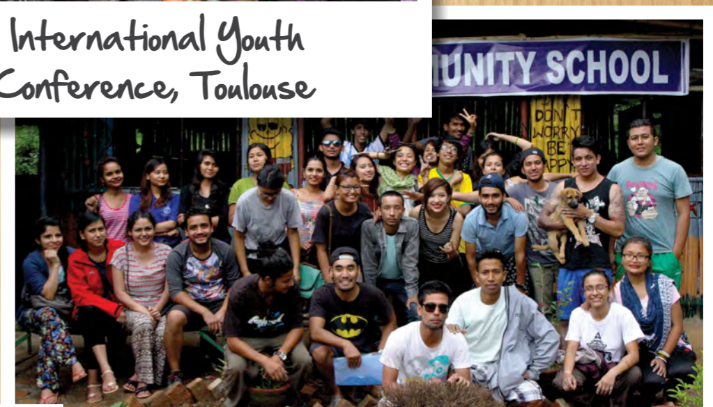
Community Service, Pharping