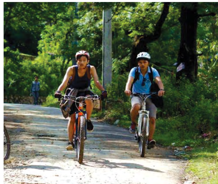
Cycling for a cause