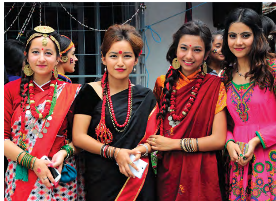
International Diversity Day