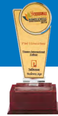
6th Best B-School of Nepal 2014