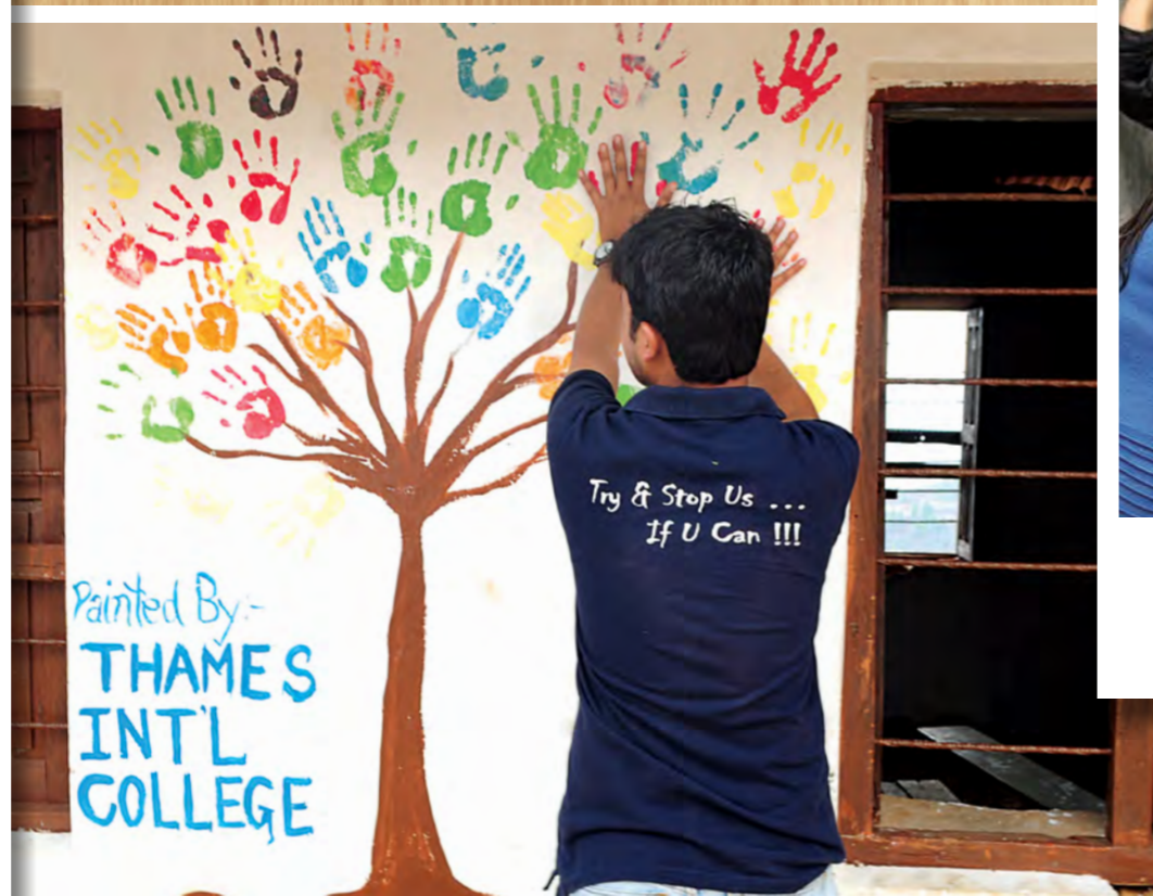
Rural Camp, Betini, Gorkha