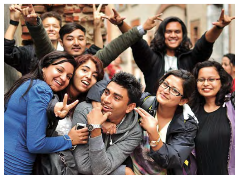
International Youth Conference, Toulouse